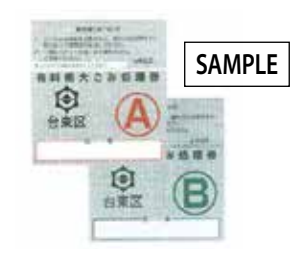
Purchase Large-sized Garbage Disposal Tickets and attach them to your items before disposal.

About recyclable items, Waste & Recycle Section, Tel: 03-5246-1291