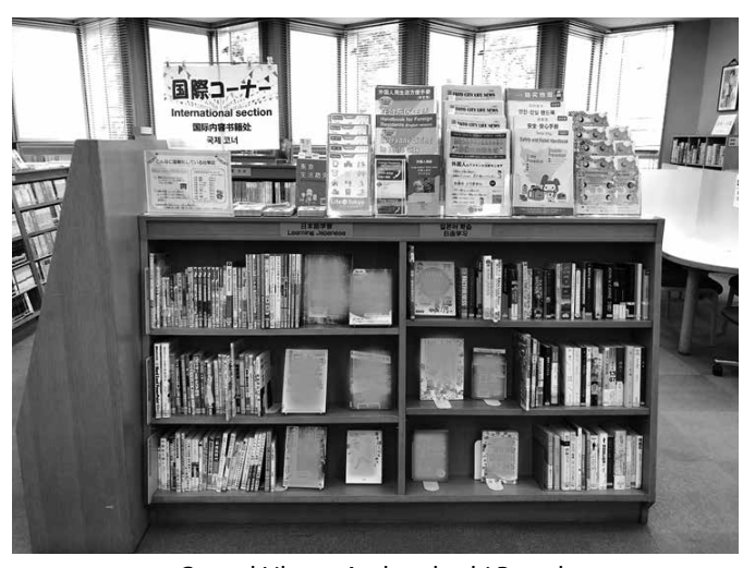
Central Library Asakusabashi Branch

Please come to the library counter with some personal identification that can verify your address (residence card, health insurance card, etc.). If you are working or going to school in Taito City, you will also need to bring a document that confirms your employment or student status.