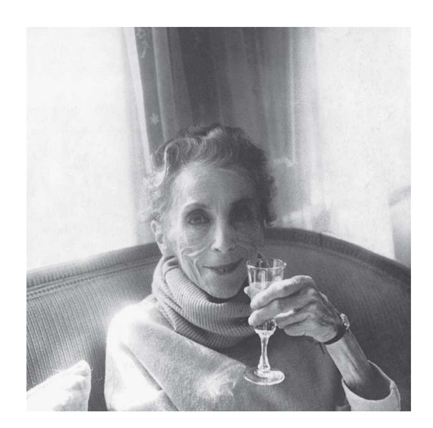
After a long happy summer at Rungstedlund, Karen Blixen's health took a notable turn for the worse in August 1962 - at one point, she weighed less than 70 pounds - but she preserved her clarity of mind until the last.

をきたし、ついには体重が70ポンド(≒32㎏)を下回ったが、彼女は最後まで明晰な頭脳を保った。ロングステズロンの長い幸せな夏のあと、1962年の8月にはブリクセンの健康状態がかなりの悪化