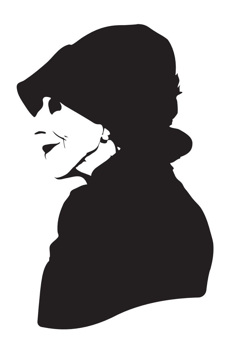
15 I am ready to depart